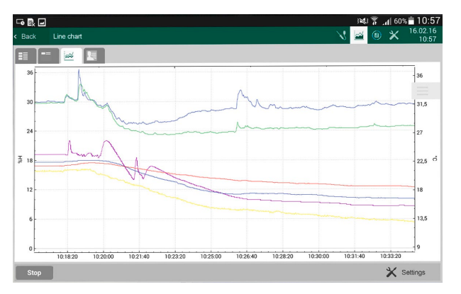
Line graphs for monitoring measurement sequences for a set period of time

Single measurement value displays for monitoring single measured values