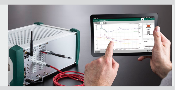
Ports for ALMEMO® sensors and for networking (OLED status display)