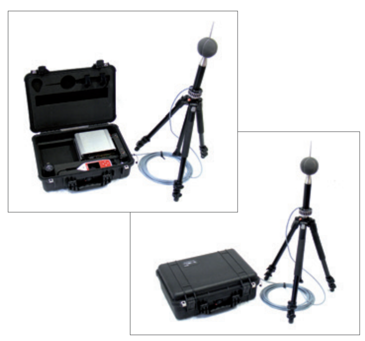
CK:670 Outdoor Kit shown with optional CT:7 Tripod

NoiseTools will display verification symbols if the information matches, a unique feature which will be useful in any legal proceedings.