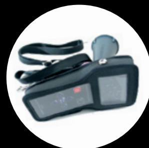
Holster Réf. LKSCOVER