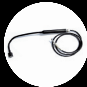
Flexible 400 mm US Sensor Réf. LKSFLEX + Flexible 1500 mm US Sensor Réf. LKSFLEX1500