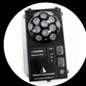
Ultrasonic emitter Réf. LKSDOME