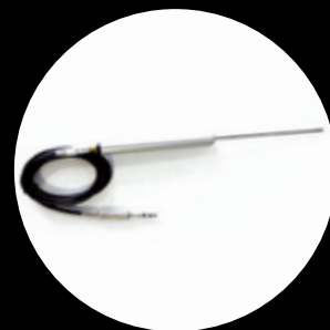
Mechanical US sensor (steam trap - bearing) Réf. LKSPROBE