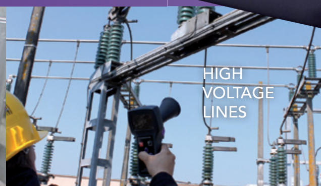
HIGH VOLTAGE LINES