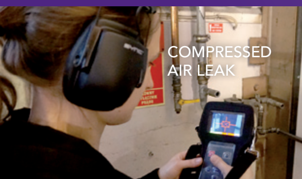
COMPRESSED AIR LEAK