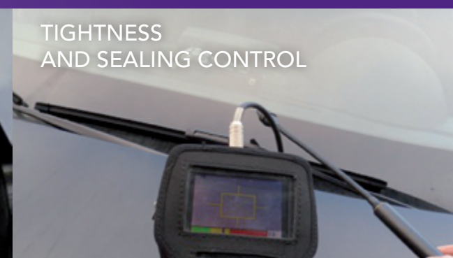
TIGHTNESS AND SEALING CONTROL