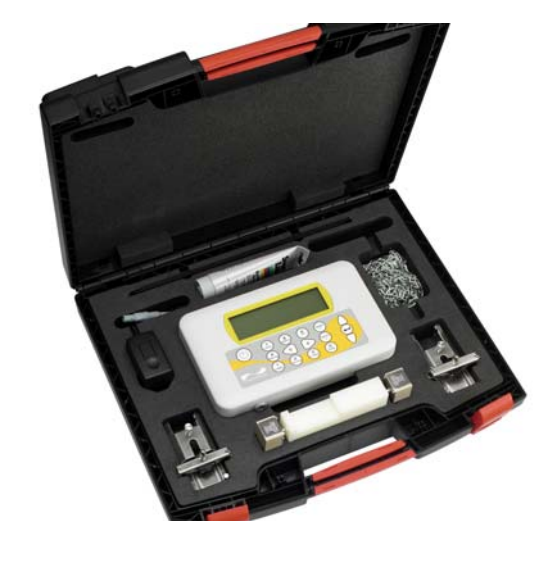
The Portaflow 220 Standard equipment is supplied in a rugged polypropylene carrying case fitted with a foam insert to give added protection for transportation.