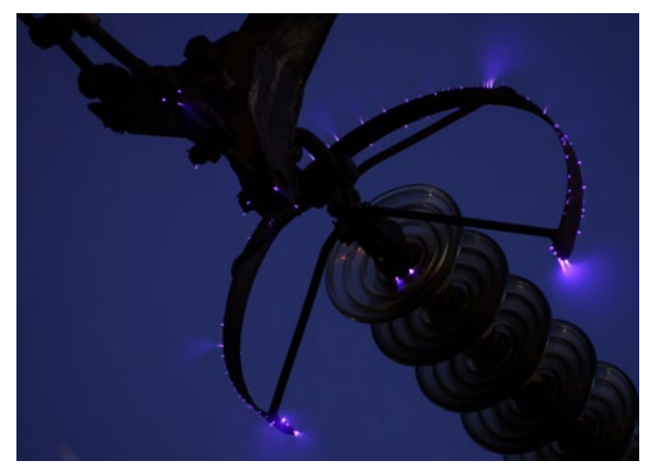
Figure 2: A corona discharge on an insulator string of a 500 kV overhead power line.